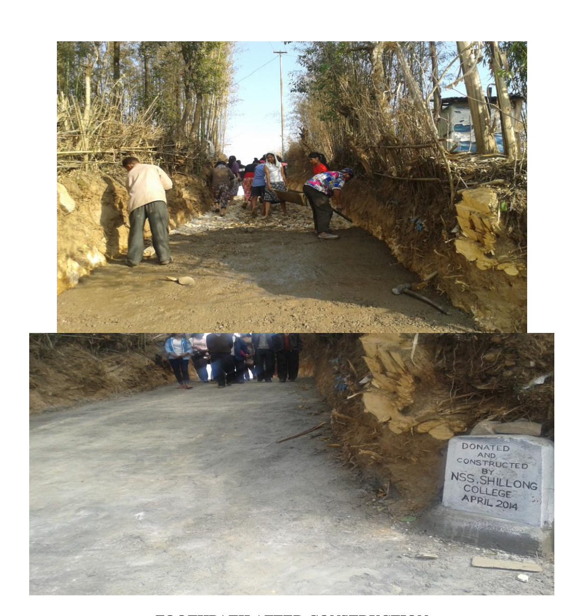
FOOTHPATH AFTER CONSTRUCTION