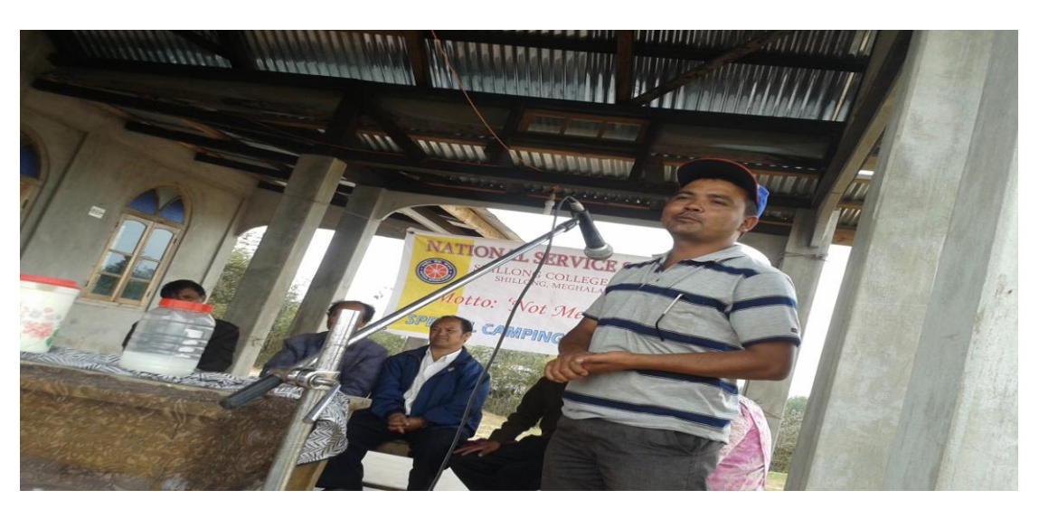
CONCLUDING DAY FUNCTION