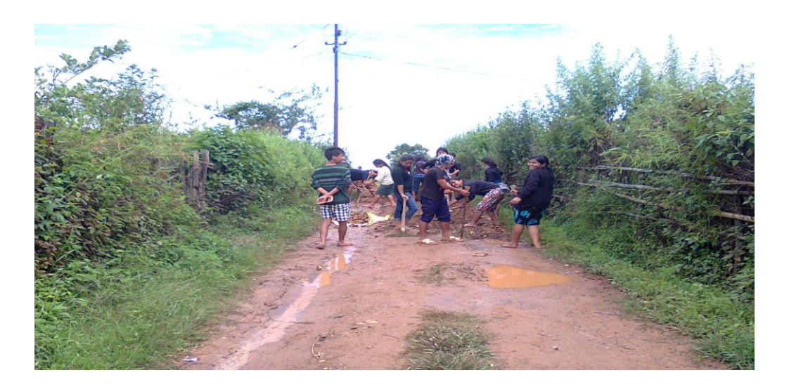
Footpath of the village before construction