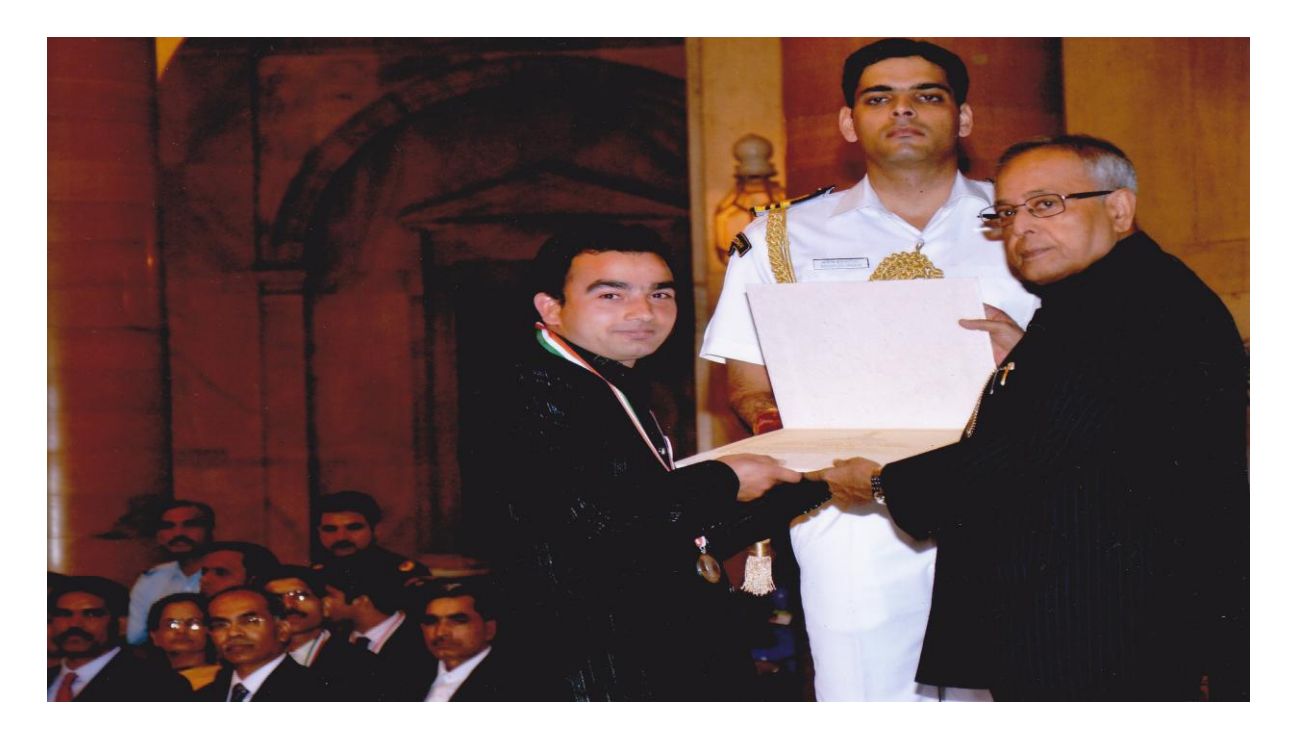
NATIONAL AWARD WINNER FOR BEST VOUNTEER 2012

Special Adventure Skill Development Course from 29<sup>th</sup> June -8<sup>th</sup> July 2012 at Pahalgam-Jammu & Kashmir sponsored by the NSS, Govt of India, Ministry of Youth Affairs and Sports