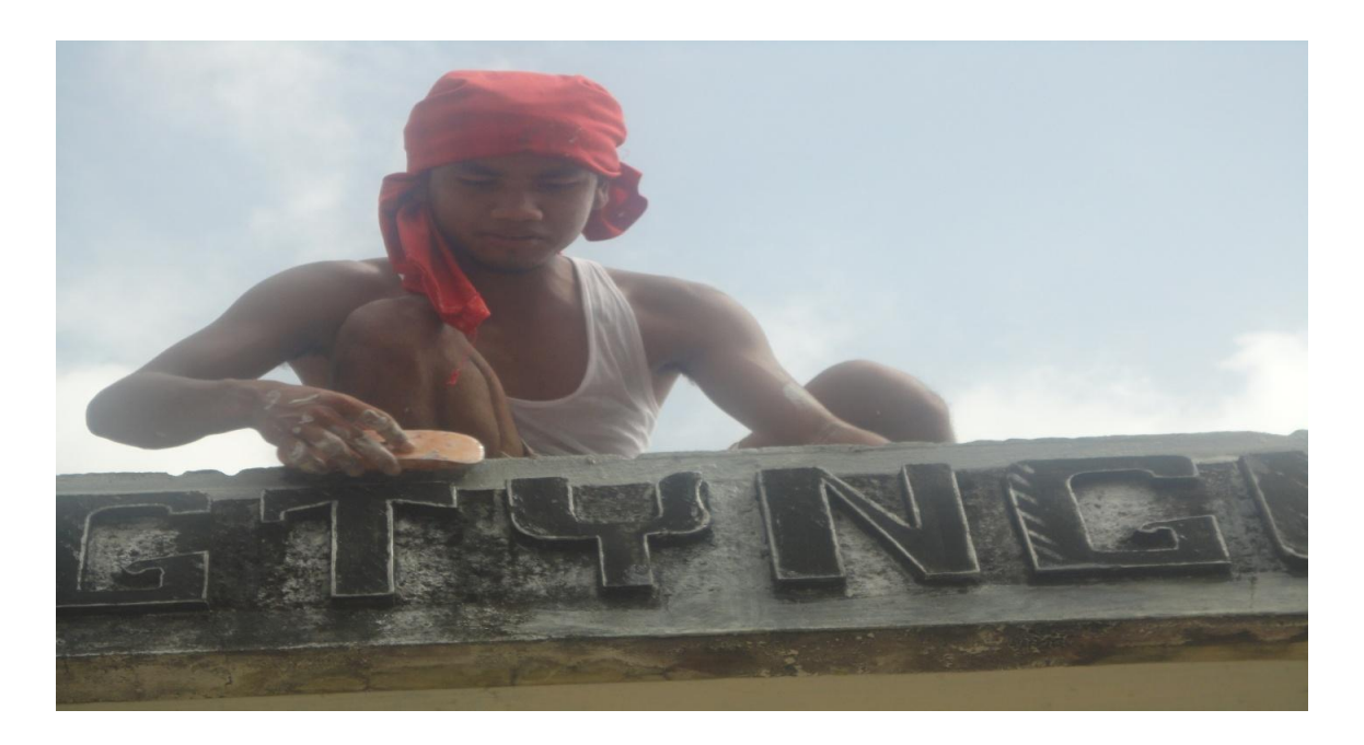
One of the volunteers cleaning the bus shed