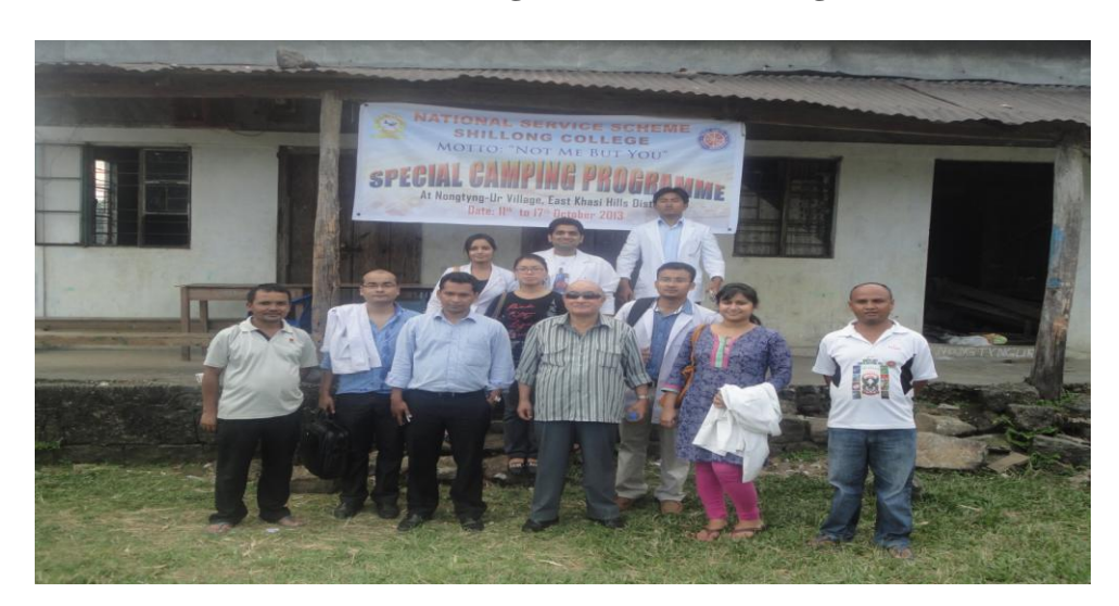
Team of Doctors with the Programme Officers