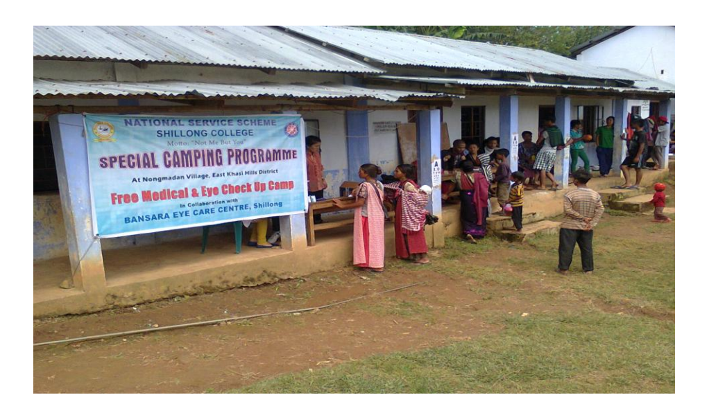
Free Medical cum Eye Check-up Programme