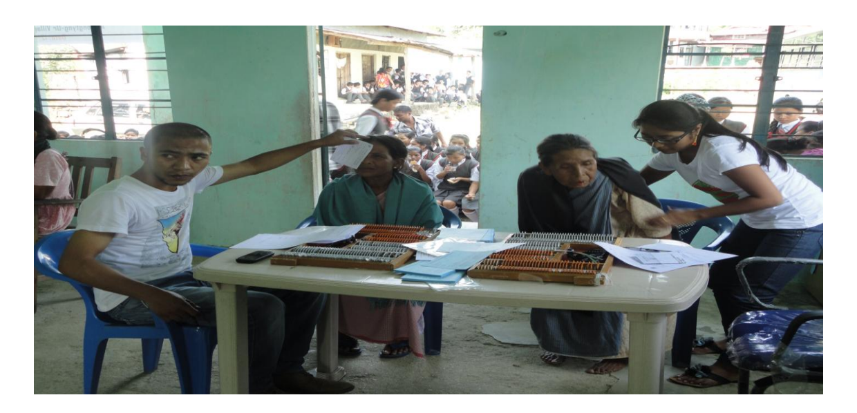
Residents of the village attending the Eye Camp