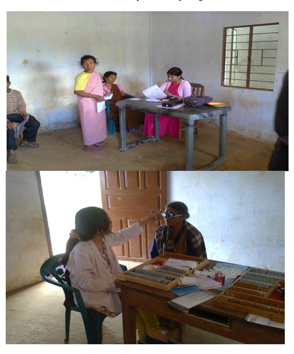
One of the residents attending the camp