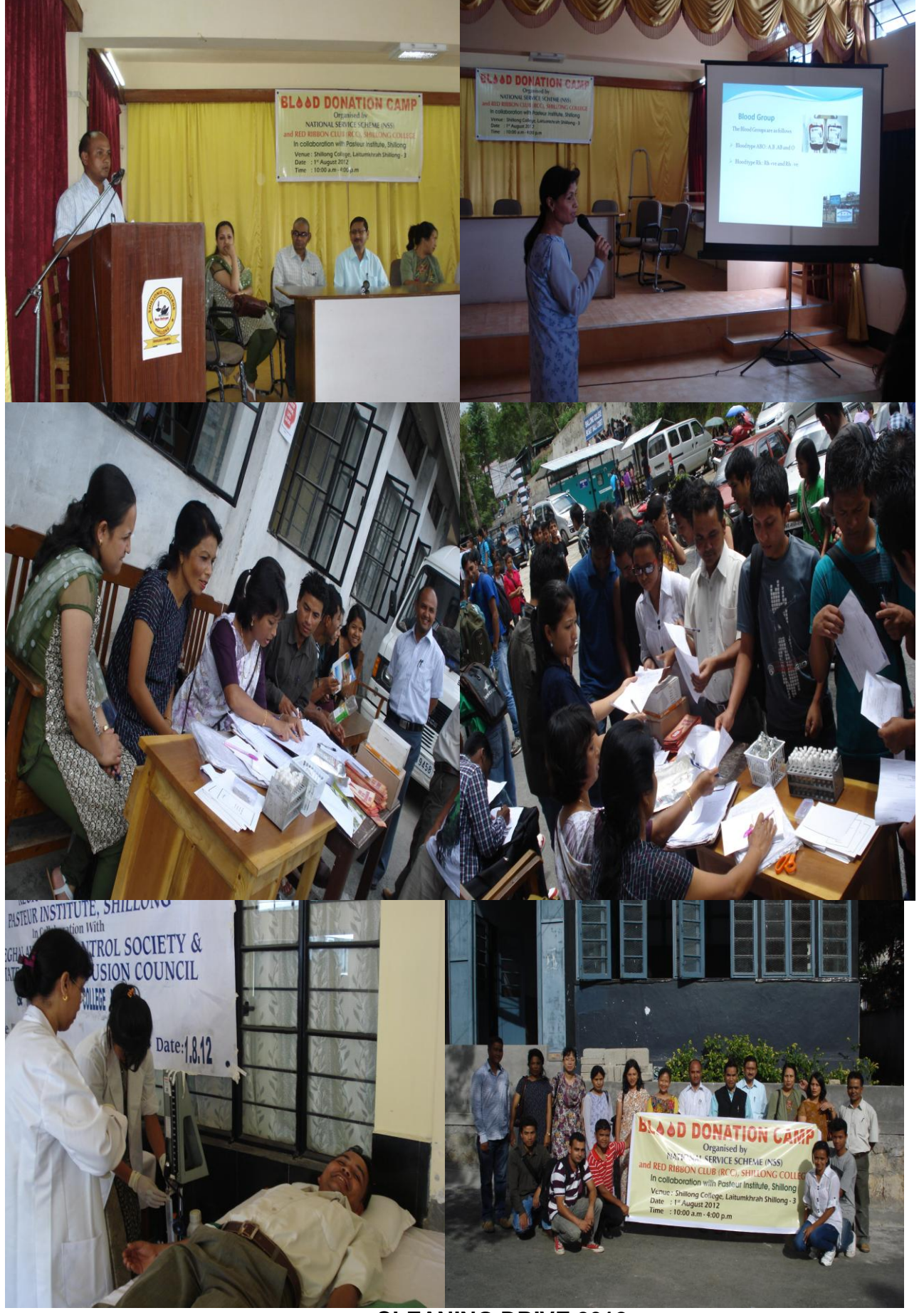
CLEANING DRIVE 2012