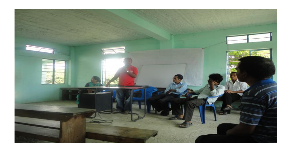
Awareness Programme on RTI