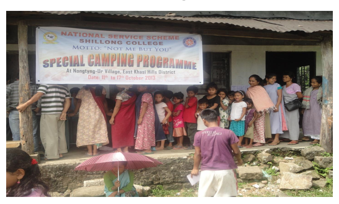
People thronging the Medical Camp