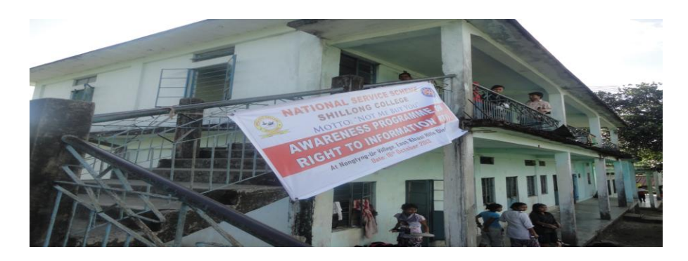
A section of People attending the Awareness Programme on RTI