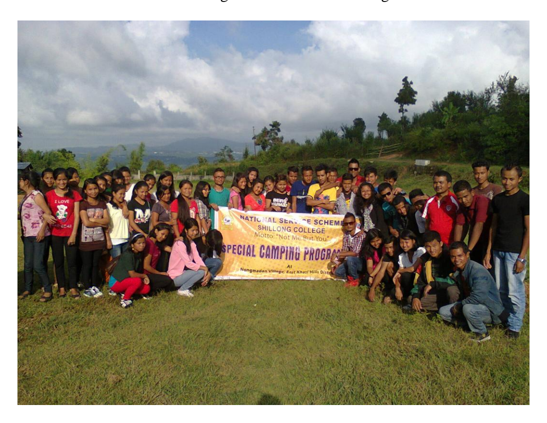
Some of the Volunteers attending the Special Camp