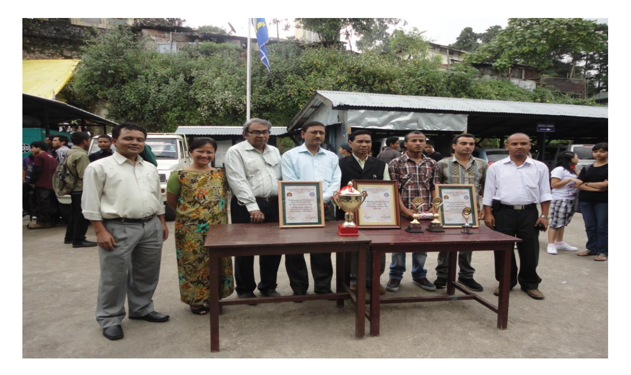
NATIONAL AWARD WINNER FOR BEST VOLUNTEER 2012 / UNIVERSITY LEVEL AWARD WINNER FOR BEST VOLUNTEER 2012 / BEST UNIT AT THE UNIVERSITY LEVEL 2011