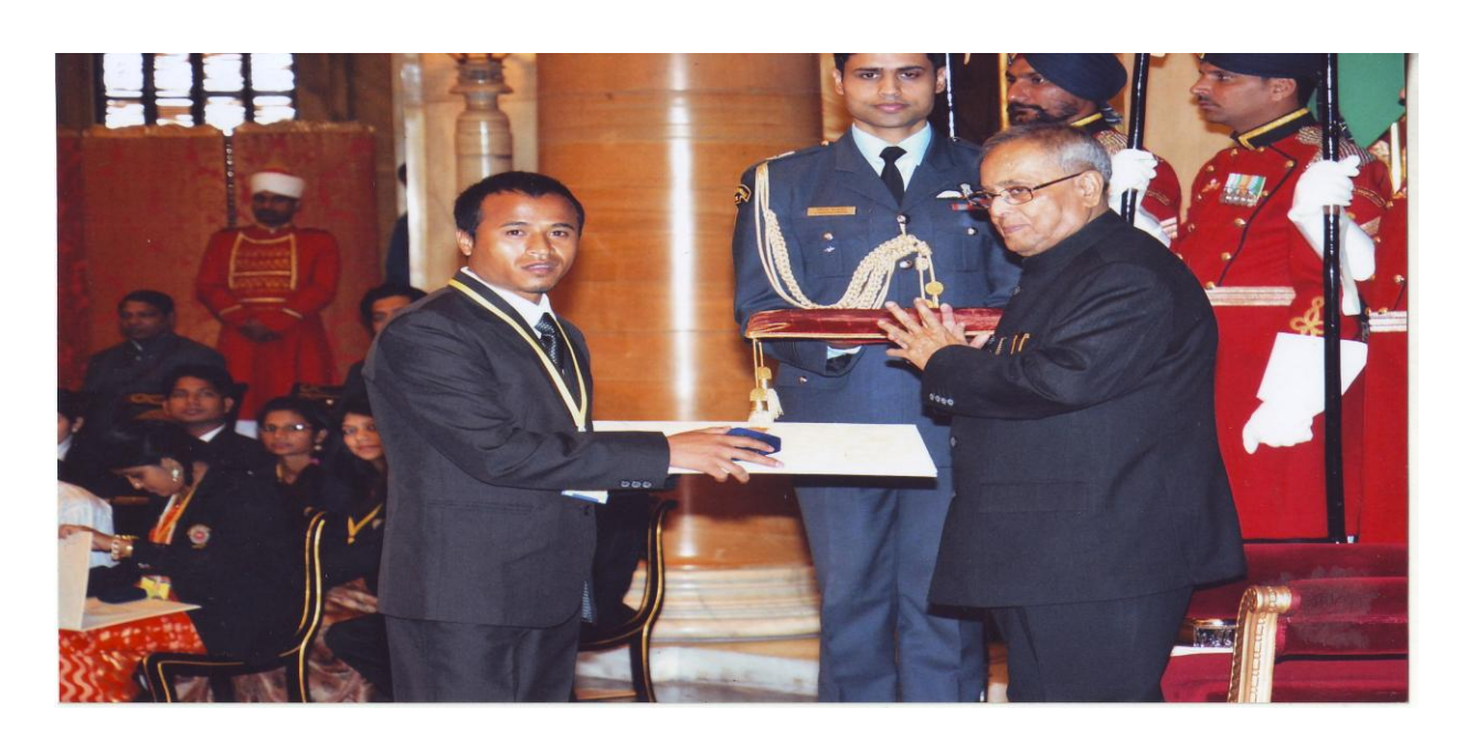
NATIONAL AWARD WINNER FOR BEST VOUNTEER 2013