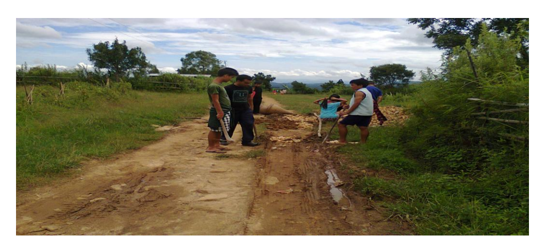
Volunteers during the construction