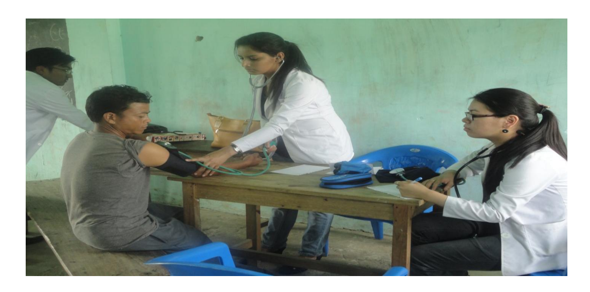
Doctors from NEIGRIHMS examining the patients