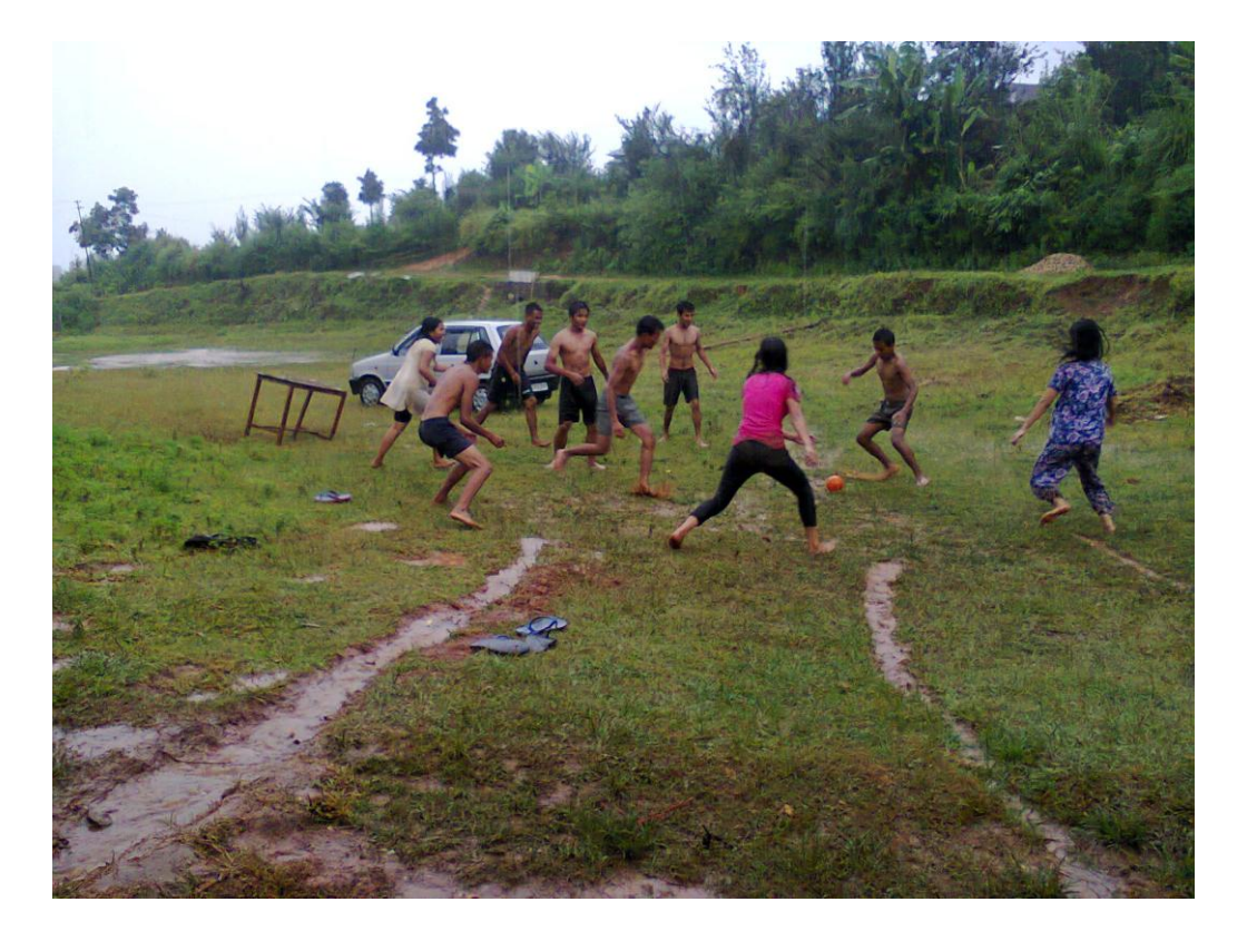
Entertaining the children of the village