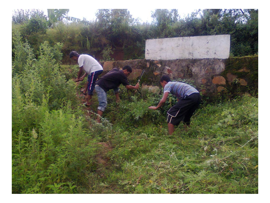
Volunteers during the Cleaning Drive in the Village