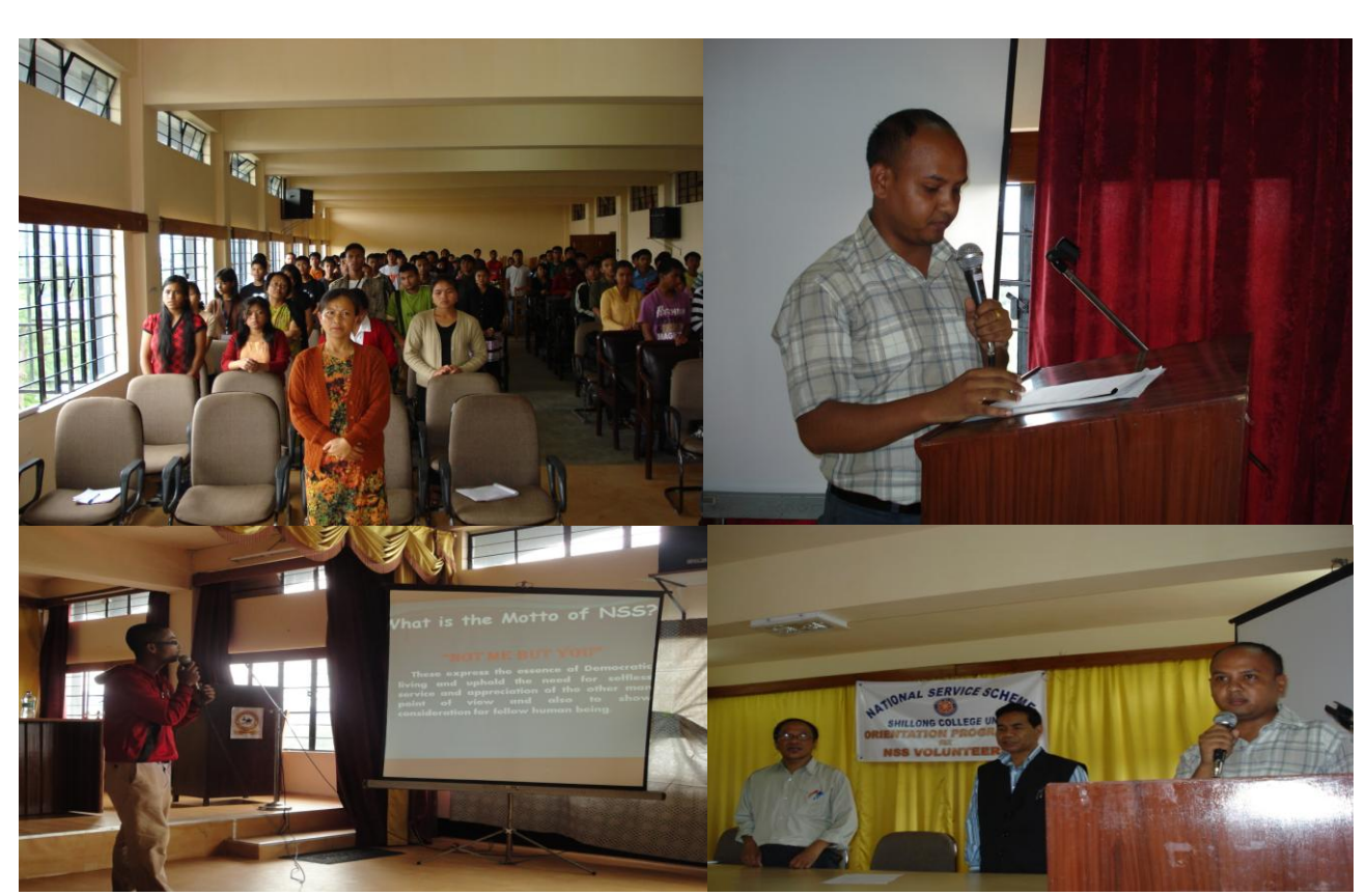
ORIENTATION FOR NSS VOLUNTEERS 2012