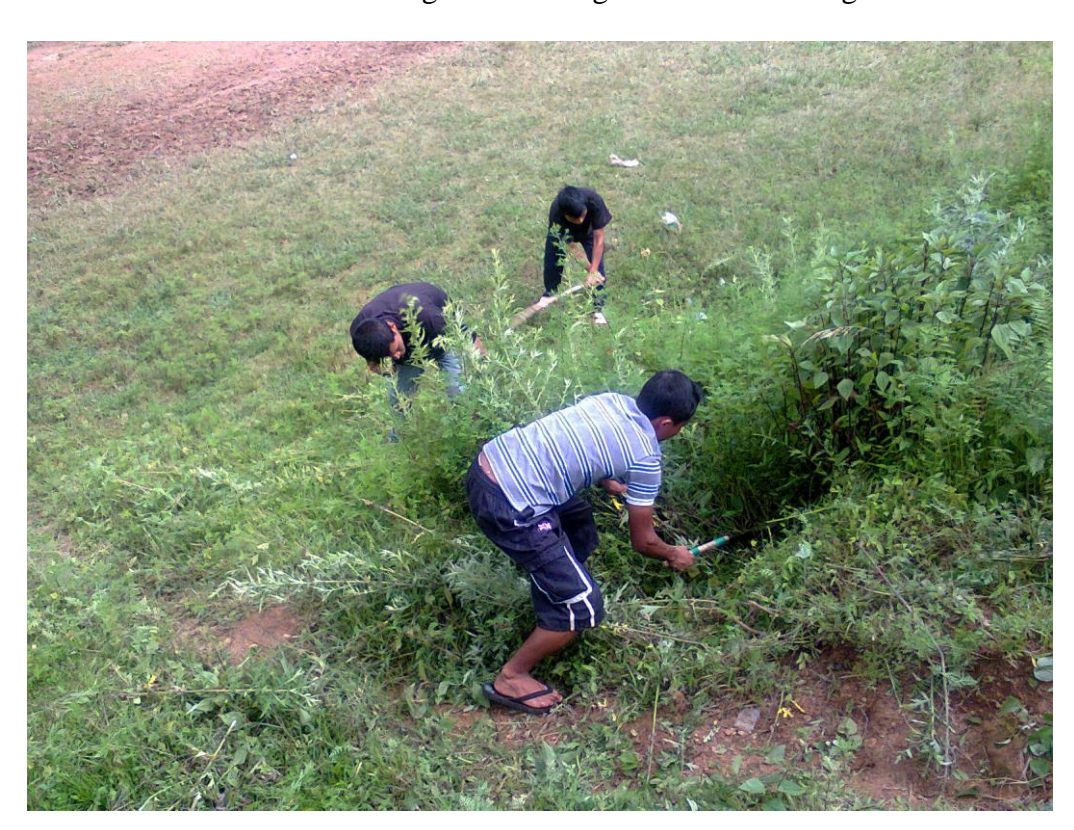
Volunteers during the Cleaning Drive in the Village