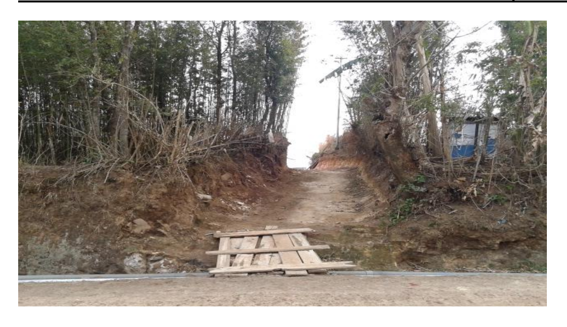
FOOTPATH BEFORE CONSTRUCTION