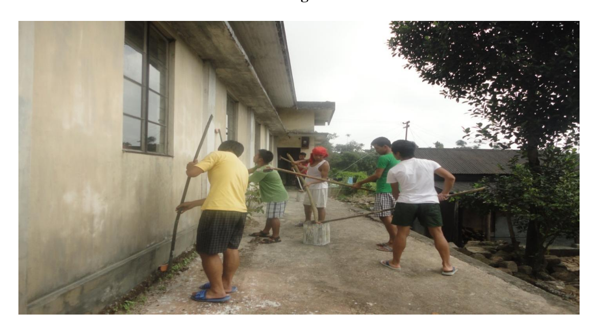
Whitewashing and painting of local Community Hall