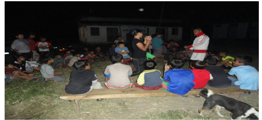
Volunteers at the childrens programme