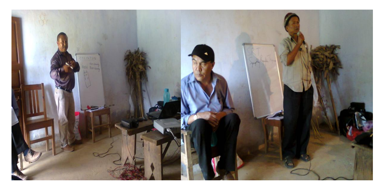
Farmers Training Programme