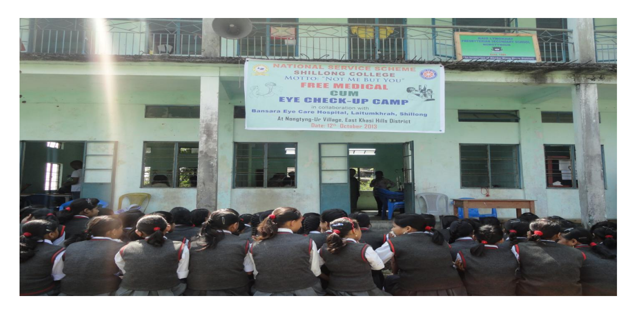
Free Eye cum Medical Checkup Camp