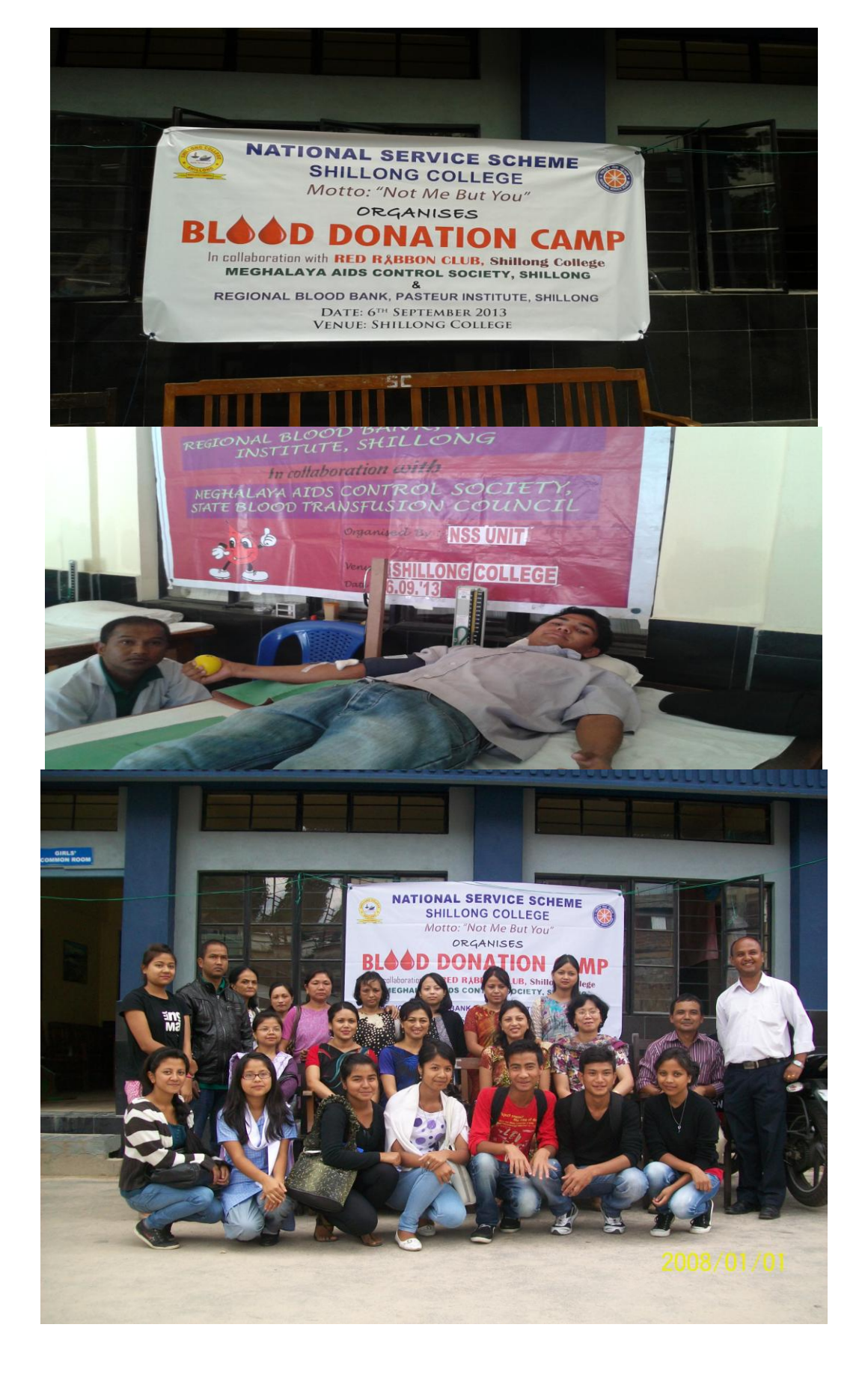
SPECIAL CAMPING PROGRAMME CONDUCTED BY THE NSS UNIT OF SHILLONG COLLEGE AT MAWJONGKA VILLAGE FROM 18<sup>th</sup> to 24<sup>th</sup> NOVEMBER 2013