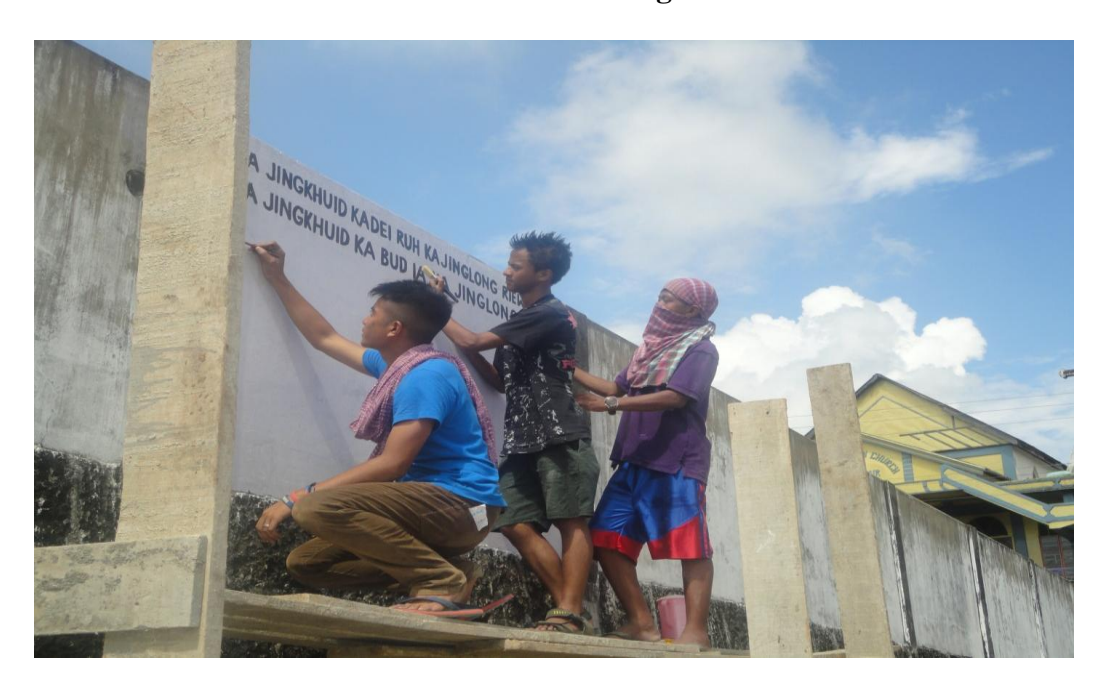
Educating people about cleanliness through posters and hoardings