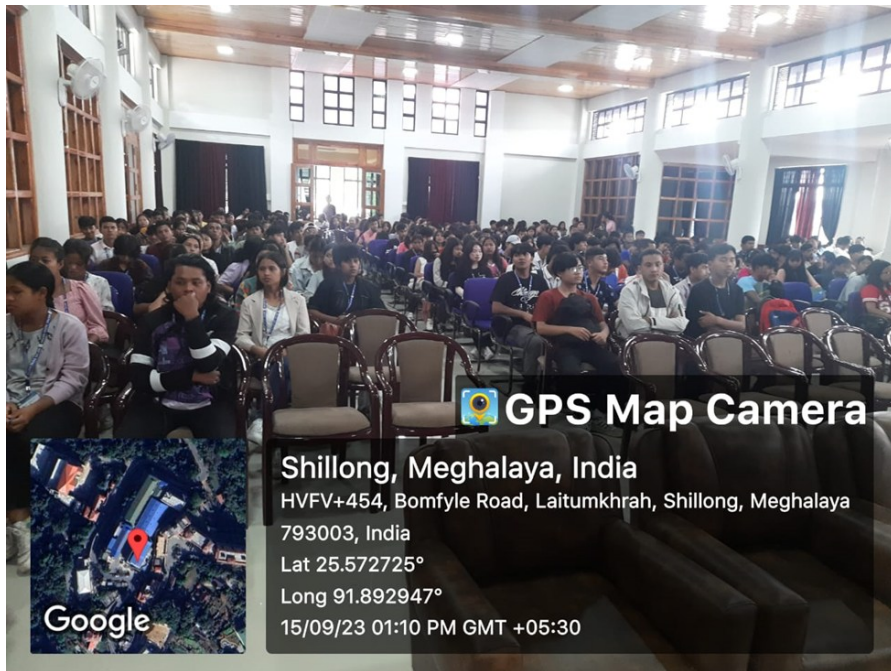
Students in the Third Session

It may be added that 1st Semester Students drawn from all the three streams including those from the professional courses enrolled under the FYUP in Shillong College attended the programme which was held in two sessions at the Auditorium attended the programme.