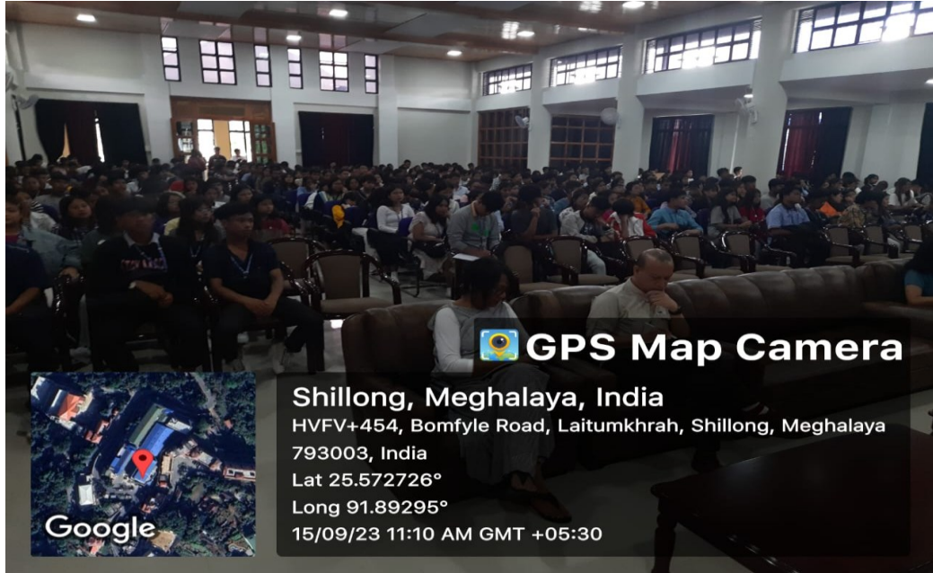
Teachers and Students in First Session of the Programme

It may be added that 1st Semester Students drawn from all the three streams including those from the professional courses enrolled under the FYUP in Shillong College attended the programme which was held in two sessions at the Auditorium attended the programme.