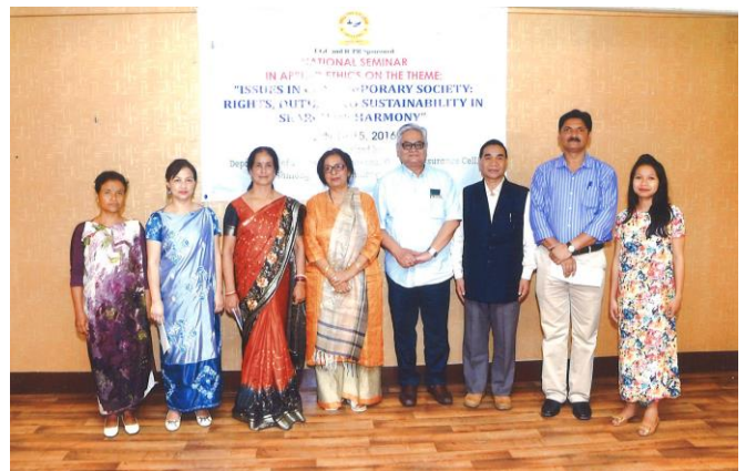
National Seminar in Applied Ethics on the Theme "Issues in Contemporary Society: Rights, Duties and Sustainability in Search of Harmony" on 14 th & 15 th of July, 2016