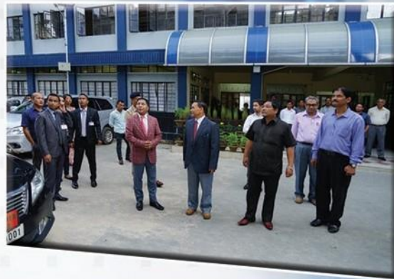
Arrival of the Chief Minister Dr. Mukul Sangma, Chief Guest for the Valedictory Function