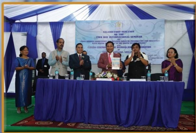
Release of the Literary Circle Publication : Translation : Transcending Boundaries