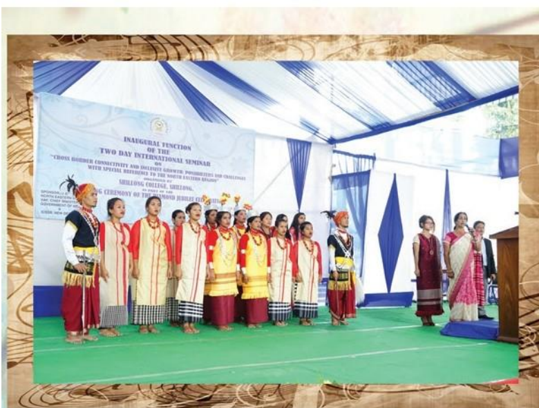
A significant moment during the National Anthem "Jana Gana Mana",