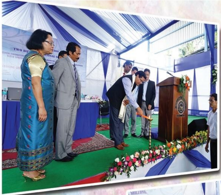
Lighting of the lamp by Hon'ble Member of Parliament Shri. Conrad Sangma Chief Guests at the Inaugural Function