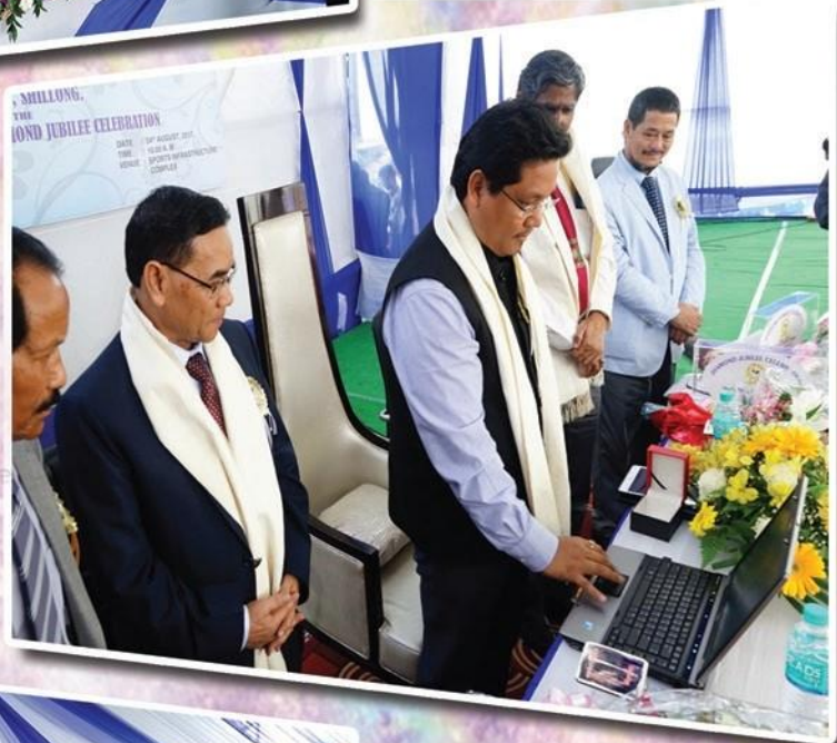
A Documentary on Shillong College entitled 60th Milestone released by the Chief Guest, Shri. Conrad Sangma