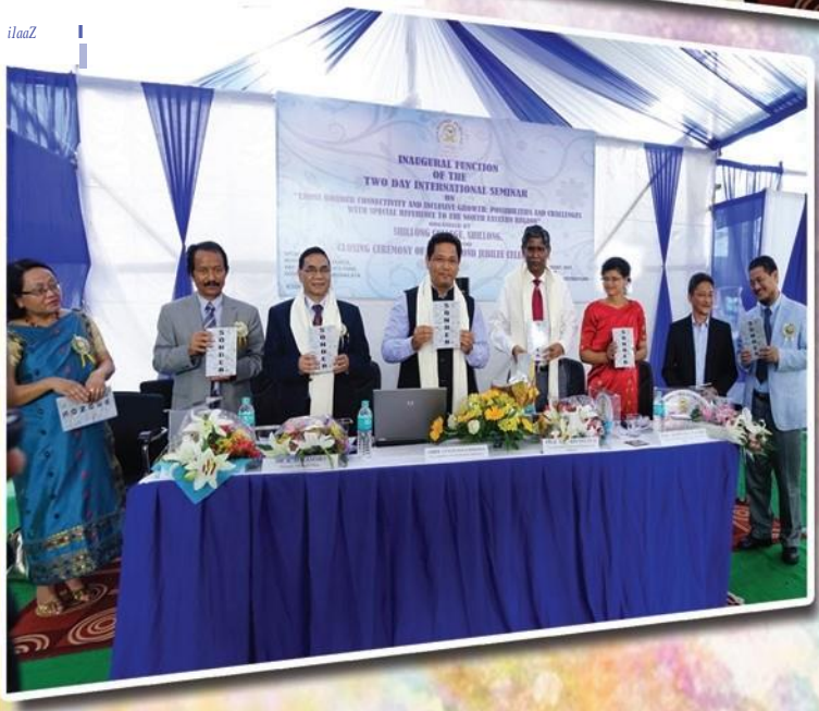
Releasing the first publication of Department of English, Shillong College : "SONDER" by the Chief Guest, Shri. Conrad Sangma