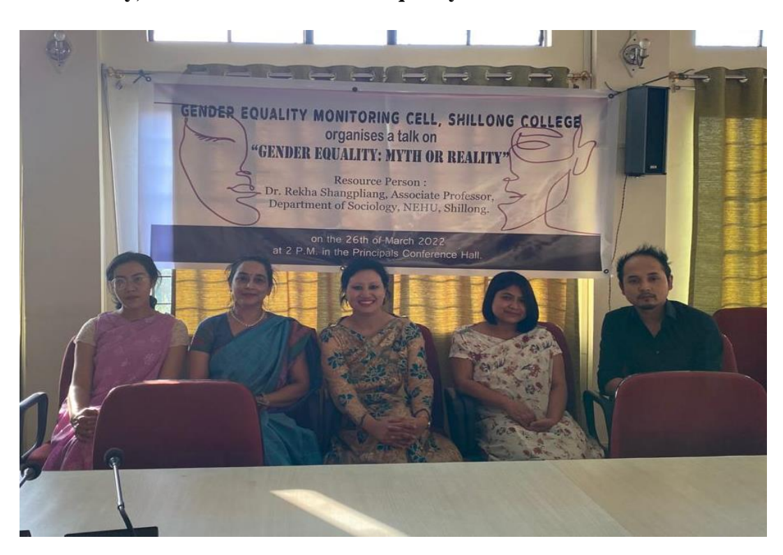
Faculty of the English Department, members of the Gender Equality Cell of Shillong College.

Sd/-Convener, Gender Equality Monitoring Cell, Shillong College