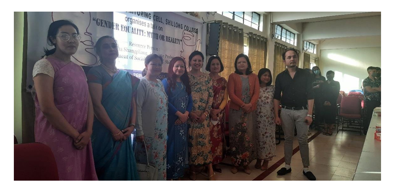
Faculty, members of the Gender Equality Cell with Resource Person.