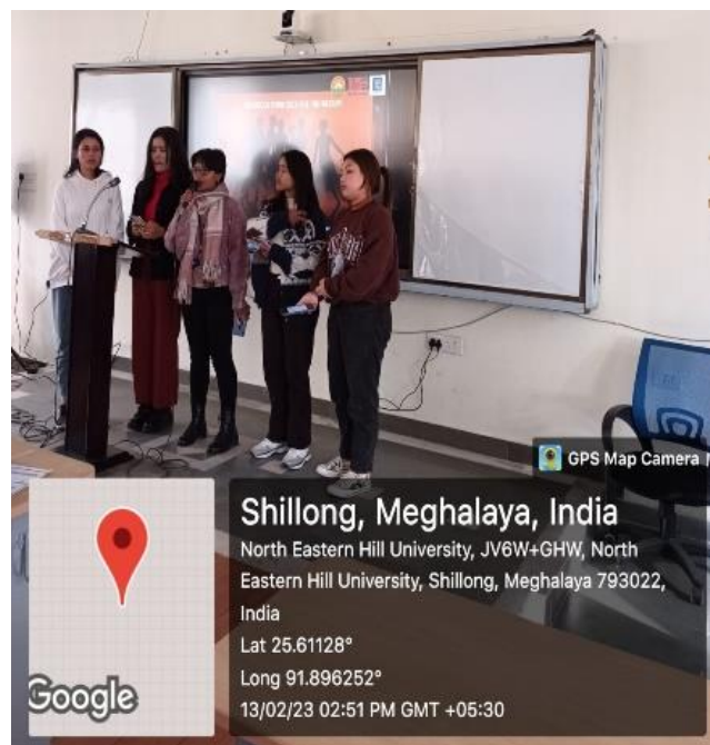
Shillong College Students presenting group song