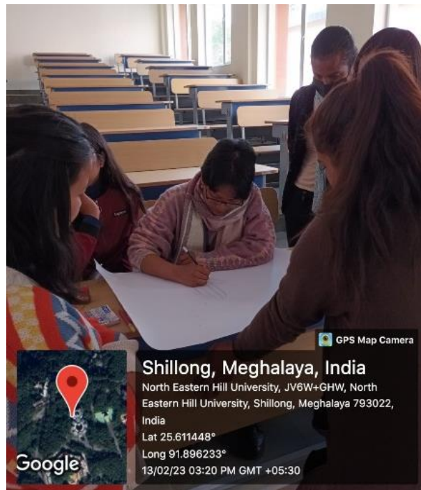
Students taking part in activities