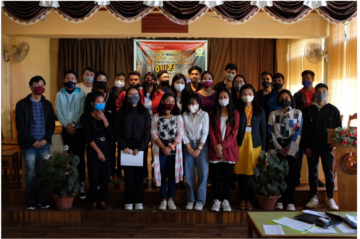
Participants of the quiz from 12 different colleges and institutions.