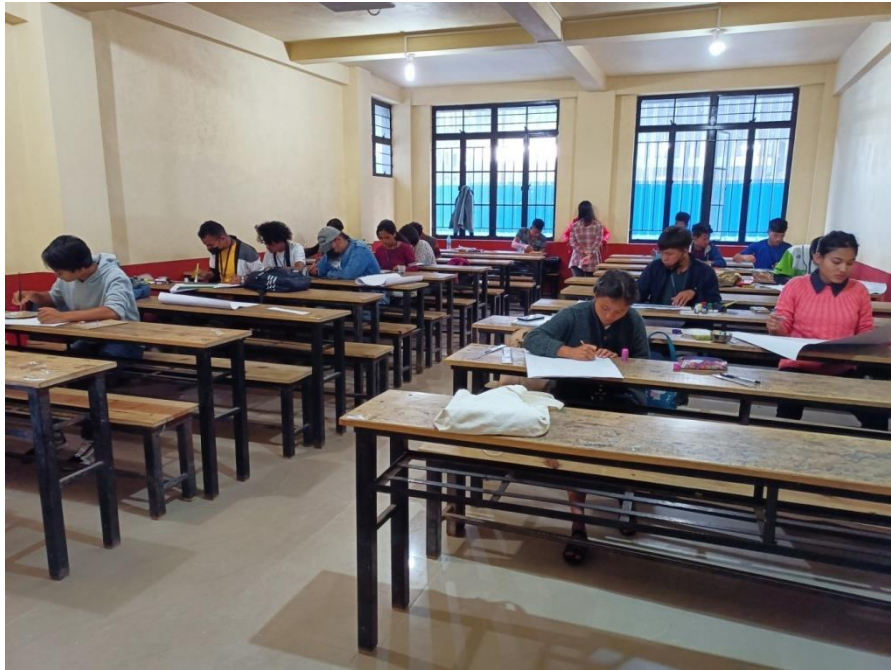
Students concentrating on their paintings.