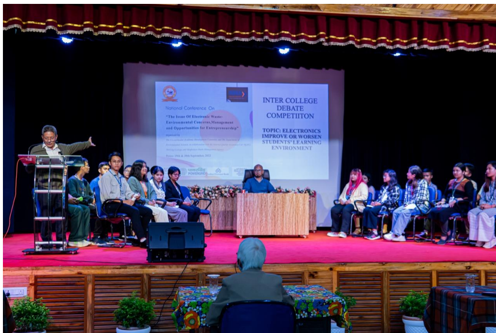
Inter College Debate Competition