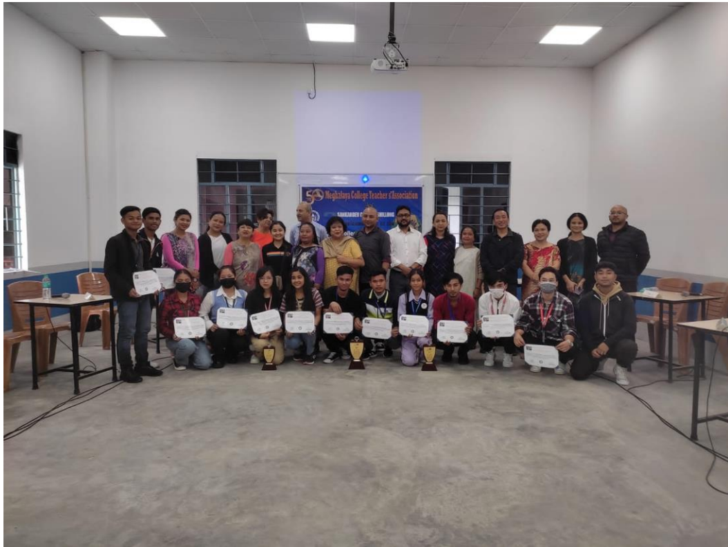
Participants with the organisers and office bearers of the MCTA at Sankardev College.