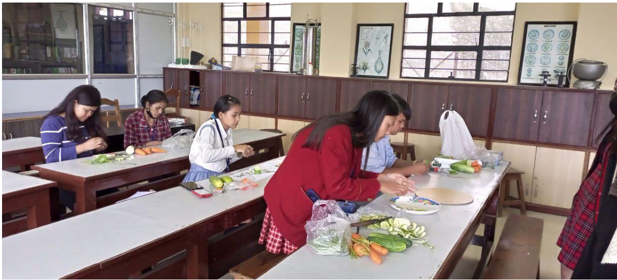
Students busy with vegetable carving.