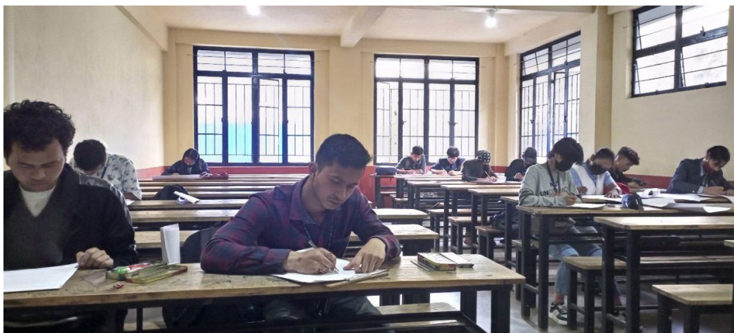
Students at work with their sketching.