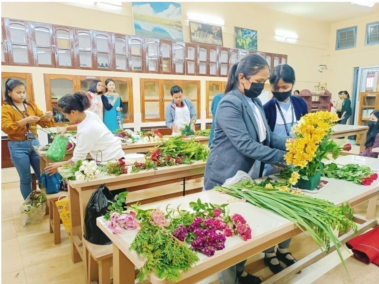
Participants getting ready for flower arrangement.