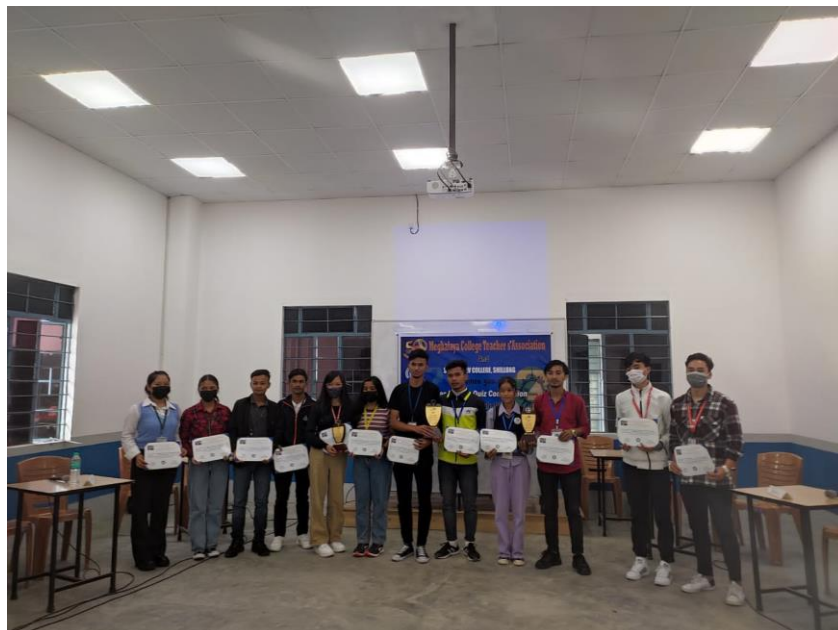
Participants of the Inter-college Quiz.