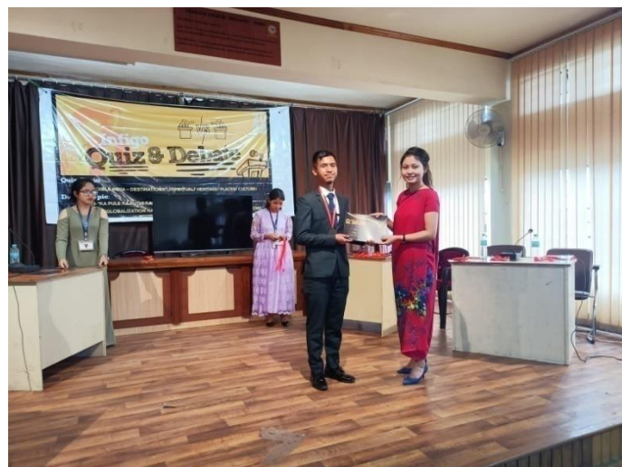
Teachers handing over the certificates to the winners.