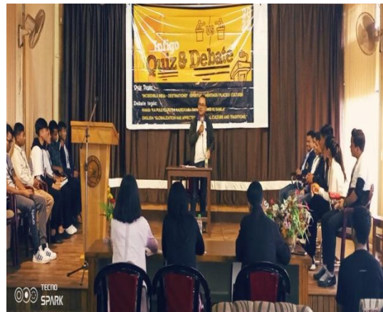
Few moments from the Khasi Debate.