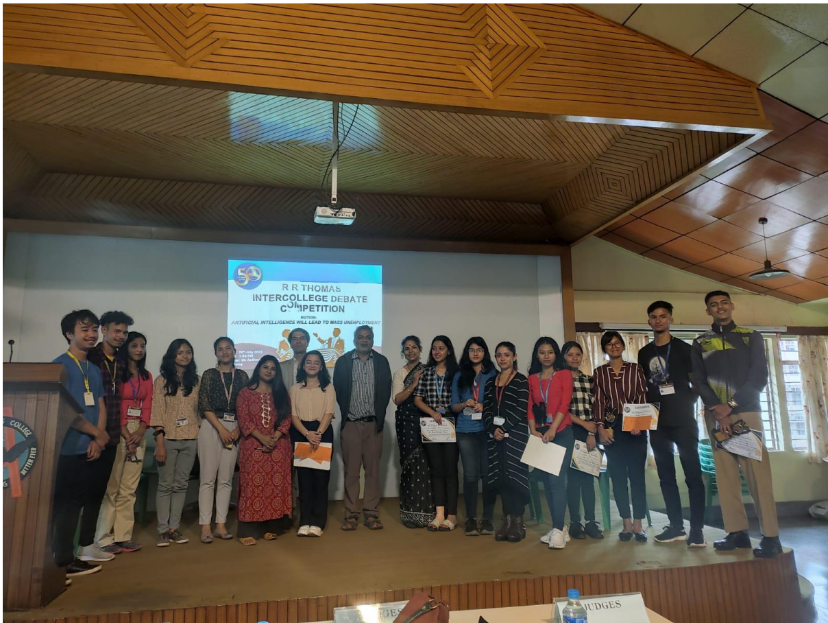
Participants of the debate.