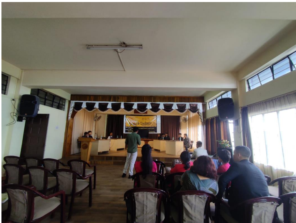
Audience engrossed with the quiz.