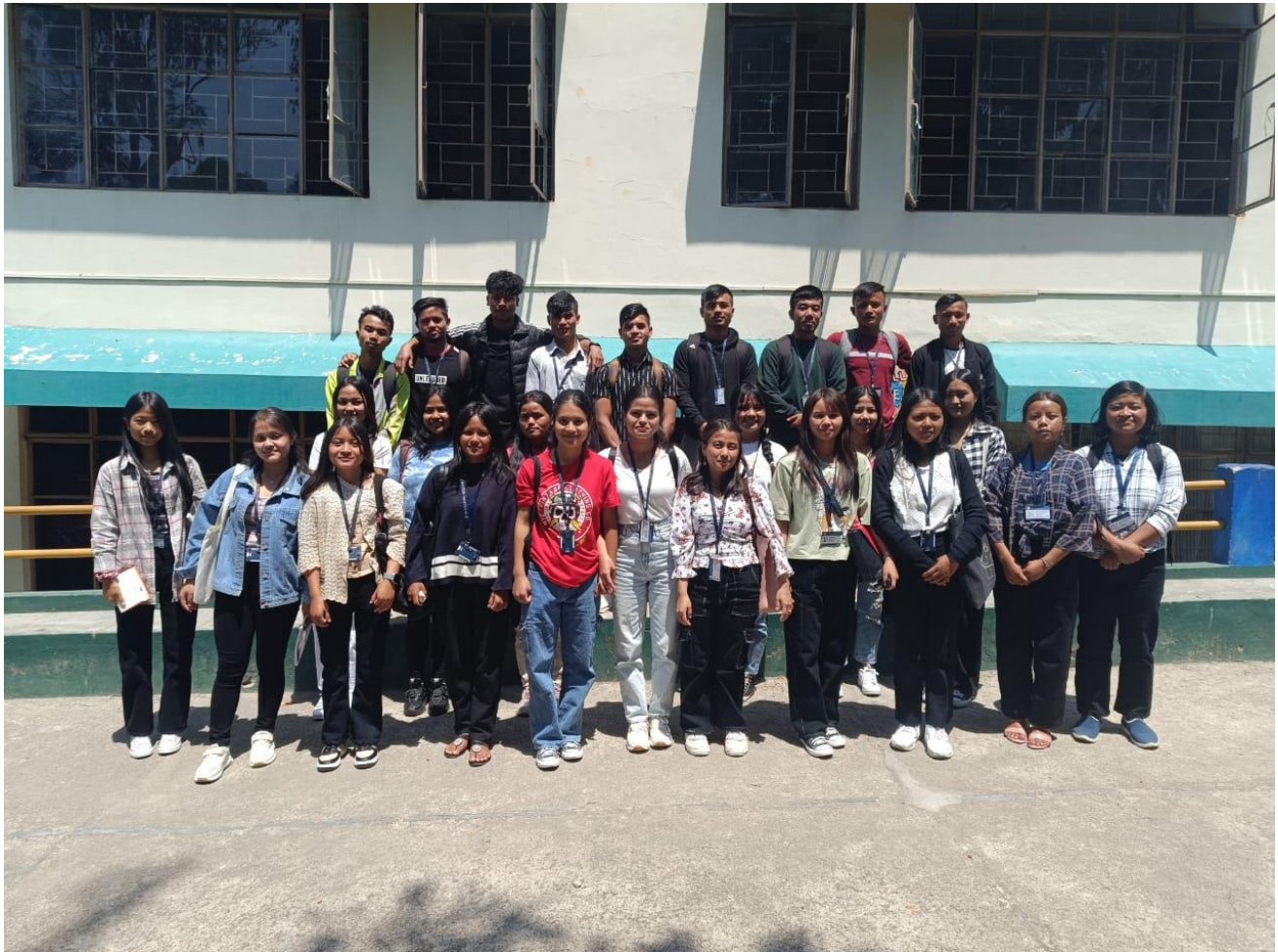
4th Semester Students Attending The Extension Programme In Jyoti Sroat Inclusive School, Shillong 11 th - 13 th April -2023

Teachers were passionate about seeing their children succeed and sharing moments of pride they saw within every child. The school is dedicated in its service to humanity, tirelessly striving to uplift the welfare of the children. Teachers cater to the needs of each student's specific learning preferences. The teachers work hard to meet the specific learning needs of the children in allowing them to overcome many of the inherent difficulties associated with their intellectual disabilities. The children were very cooperative and always trying to help one another in spite of their individual differences. The students found the programme informative and interesting.